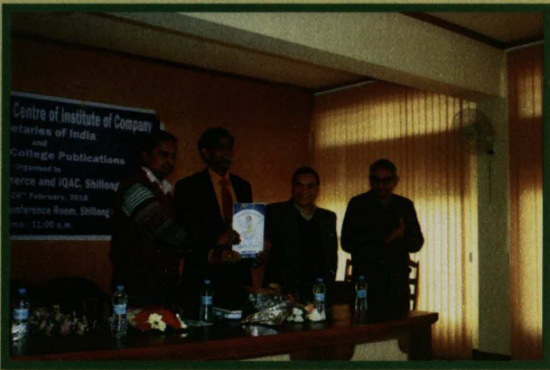
VC, NEHU releasing the NSS Annual Magazine