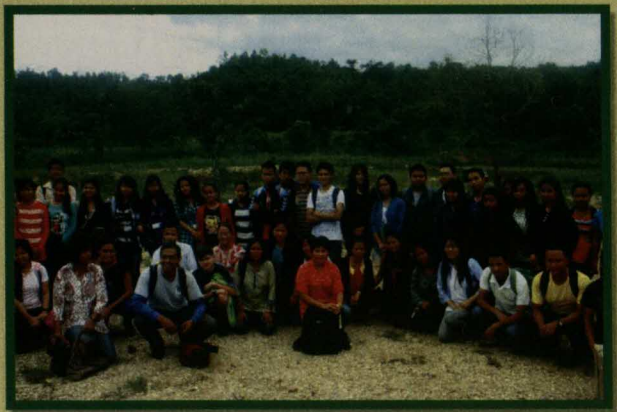
A group of participants of Ecosystem Conservation Training at the Grace City