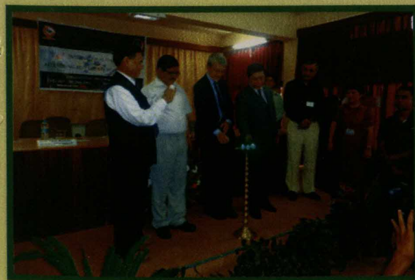
Dr. Mukul Sangma Inaugurates the International Seminar on Attracting Best Talents in Basic Sciences