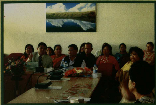
A scene at the interaction and discussion