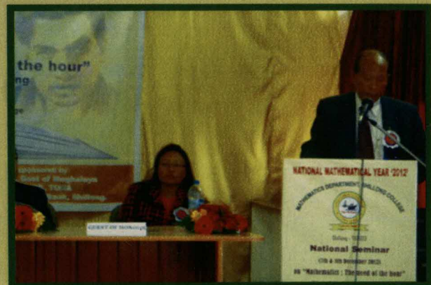
Inauguration of National Seminar on Mathematics- the need of the hour