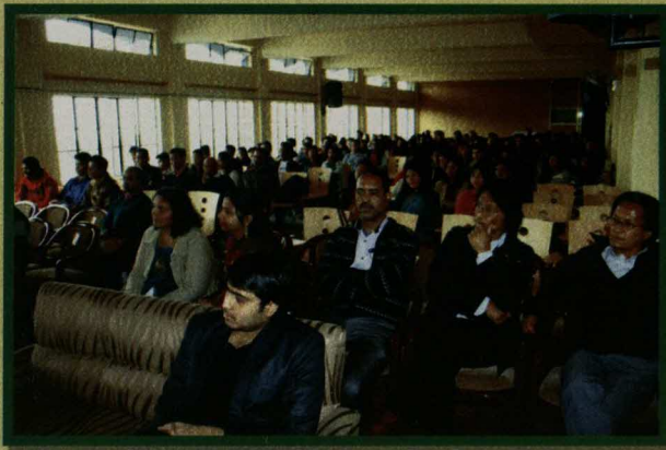
A scene of audience on the opening of Study Center on ICS