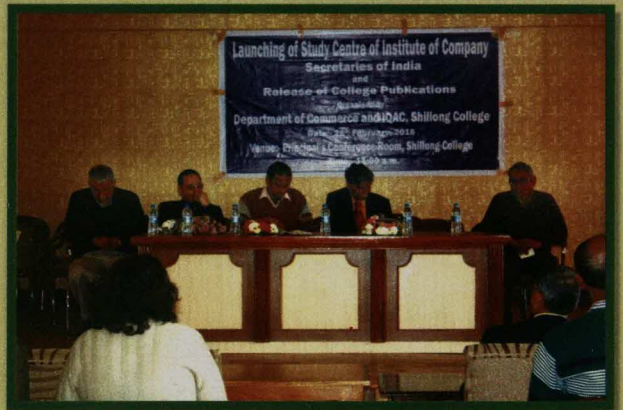
Launching of Study Center of Institute of Company Secretaries of India