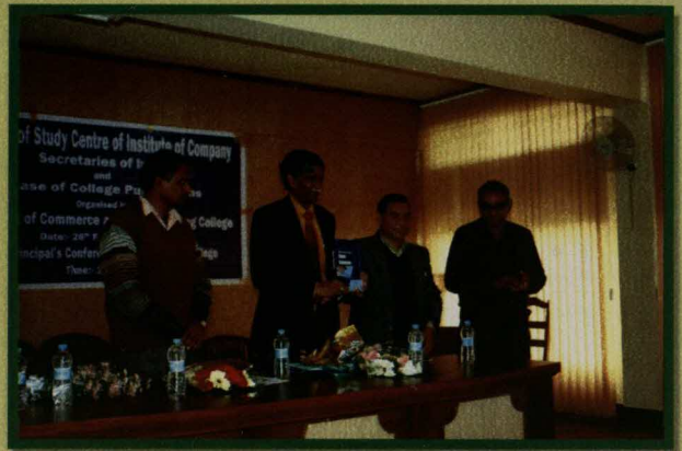
VC, NEHU releasing the proceedings book of the International Seminar