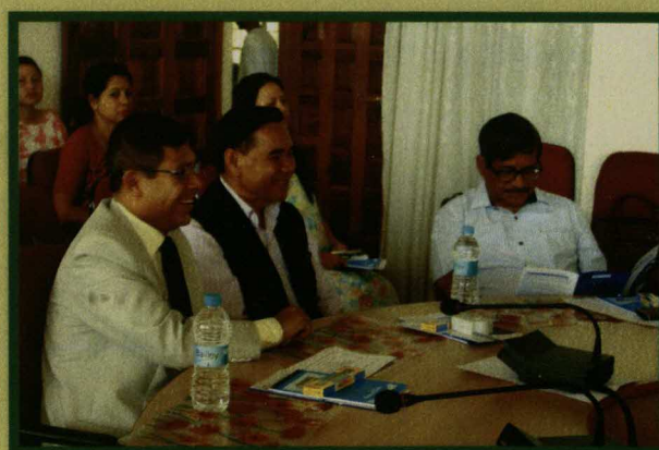
The resource persons relaxing before the start