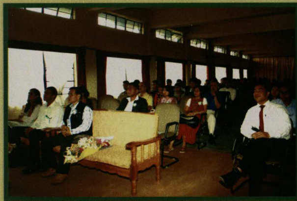
Valedictory Session of the Training Programme